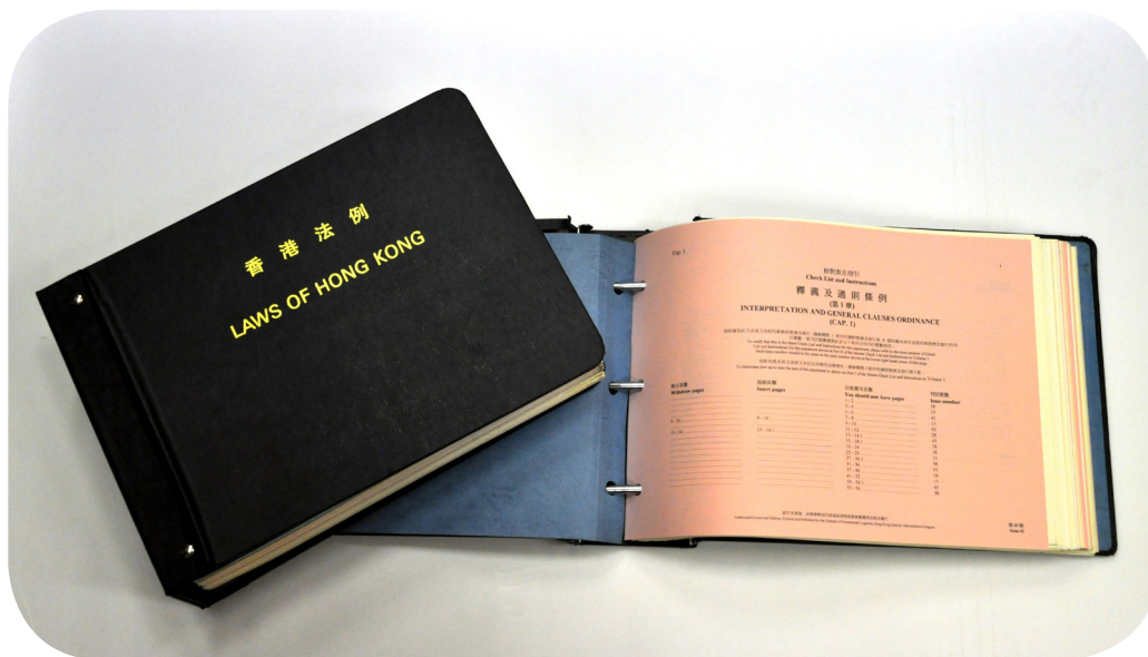
Laws of Hong Kong

A flowchart illustrating the legislative process is in the Appendix .